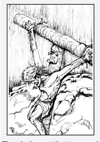
The darkness that covered the land showed God's judgment against sin.

What is it like to feel separation from God due to sin? Why is claiming the righteousness of Christ our only way back? Why must this claim come with repentance,<sup>4</sup> confession, and a decision to stop sinning?