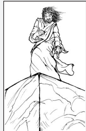
All through the Bible, Christ is pictured as a rock.

But what do these verses tell us about who the Rock really is and upon whom the church is built? (1 Corinthians 10:4; Matthew 7:24, 25; Ephesians 2:20).