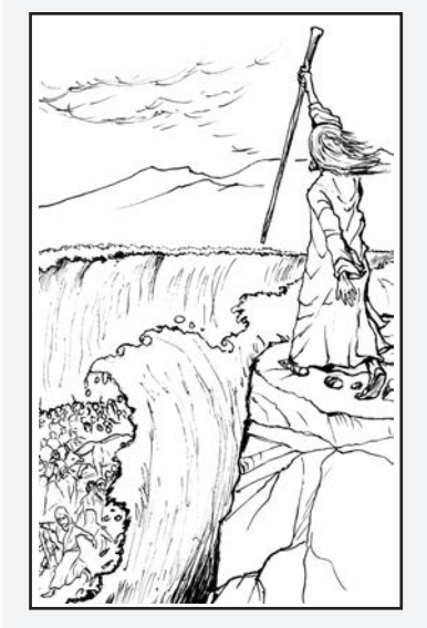
The children of Israel were saved by grace at the Red Sea before they were asked to obey at Sinai.

What should your own experience with the Lord and His law teach you about why salvation has always had to be by faith and not by the law?