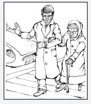
The only true faith is that which works by love.

Suppose you are a great believer in salvation by faith alone. And you believe that only Jesus' righteousness can save you. Then what can you do to keep legalism from creeping into your spiritual life?